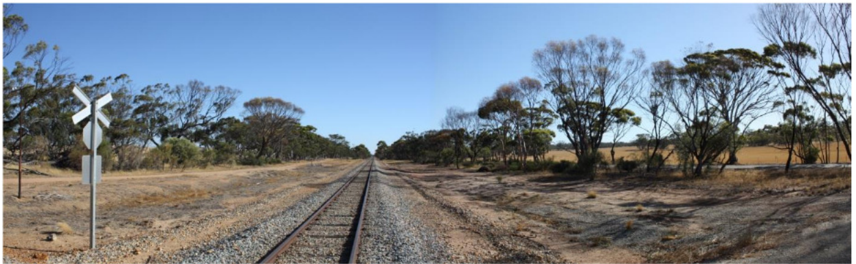
Above: sick trees along rail line 12km south of Moora