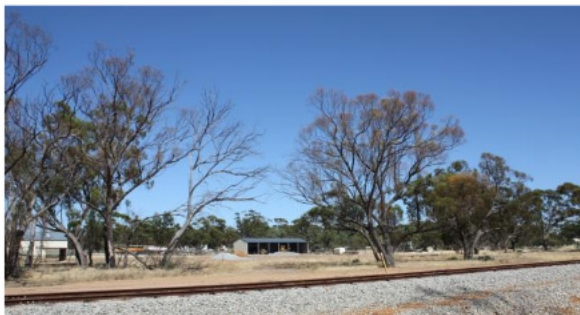
Above: sick York Gum trees in Moora