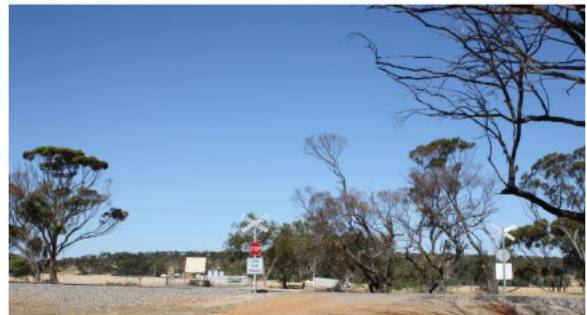
Above: sick trees at Coomberdale wildflower farm crossing

This evidence was brought to the attention of the Department of Parks and Wildlife (DPaW) who forwarded the information on the Brookfield Rail. As a result, MCC organised a meeting on 23 rd January between Brookfield Rail, rail maintenance contractor John Holland, Shire of Moora, DPaW, Roadside Conservation Committee and local concerned residents to discuss what has happened and what can be done to remedy the situation. Frank discussion were held between the stakeholders about Brookfield Rail’s herbicide spraying practices along the rail line and the huge devastating consequences that will result from the loss of these trees. A residual herbicide chemical is thought to be the blame with the John Holland representative explaining that 2013 was the last year of a three year program using this chemical alongside Glyphosate to help control the weeds - especially the resistant rye grass. York Gums, Salmon Gums and Wandoo have lateral root systems that extend to at least once to twice the height of the tree and so the chemical could have infiltrated the soil to roots